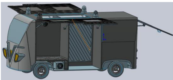
Figure 2. Conceptual Model Design2